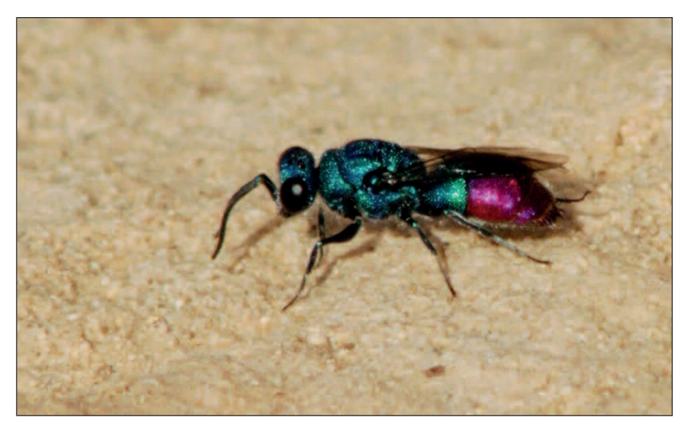
Fig. 1 — Adult Chrysis exsulans Dahlbom, 1854 at Lampedusa Island (Is. Pelagie, Sicilian Channel, Italy) 29.X.2012.