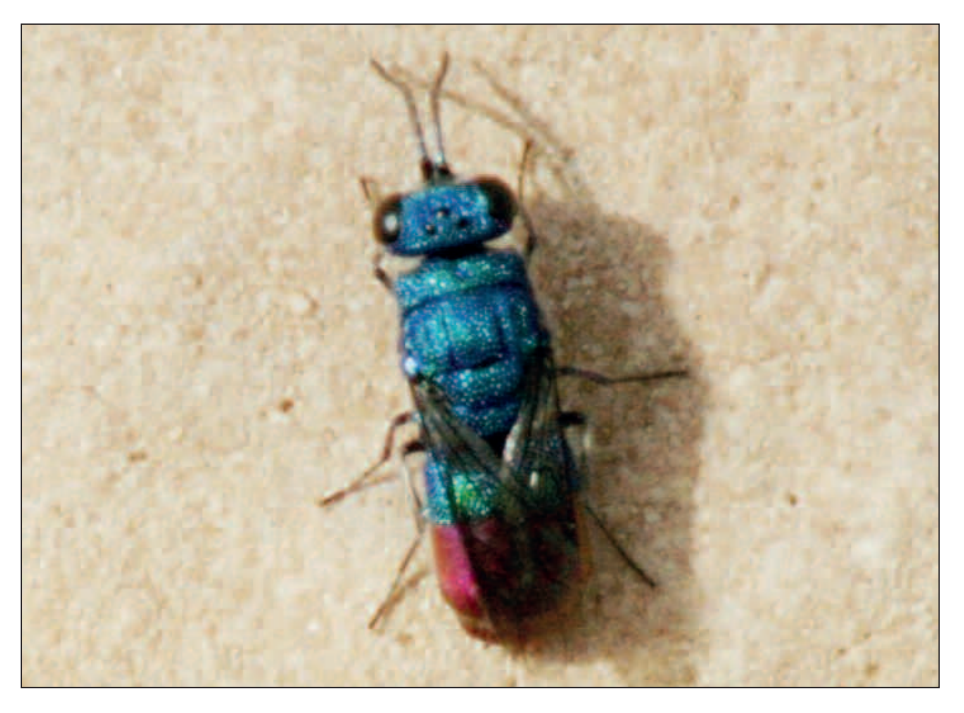
Fig. 2 — Adult Chrysis exsulans Dahlbom, 1854 at Lampedusa Island (Is. Pelagie, Sicilian Channel, Italy), 29.X.2012.